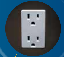
A power supply