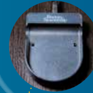
The base station