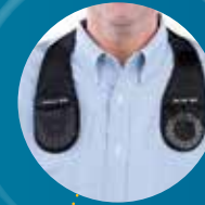
The charging collar and accompanying counterweight